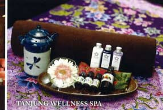
TANJUNG WELLNESS SPA