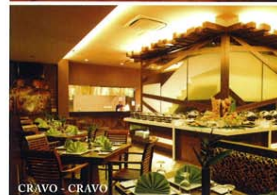
CRAVO - CRAVO