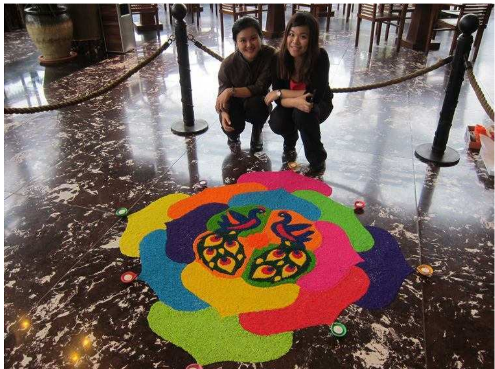
Vibrant peacock kolam

Text Gaya Travel November 10, 2012 | 11 views