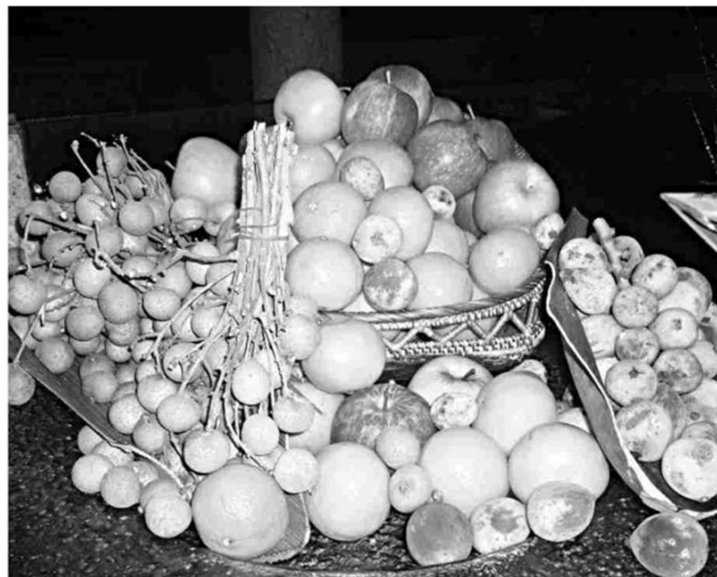
A plethora of regional and local fruits

The Hari Raya package will include accommodation in the resort's Pavilion Room, daily breakfast for two, Hari Raya special dinner for two, making of rendang