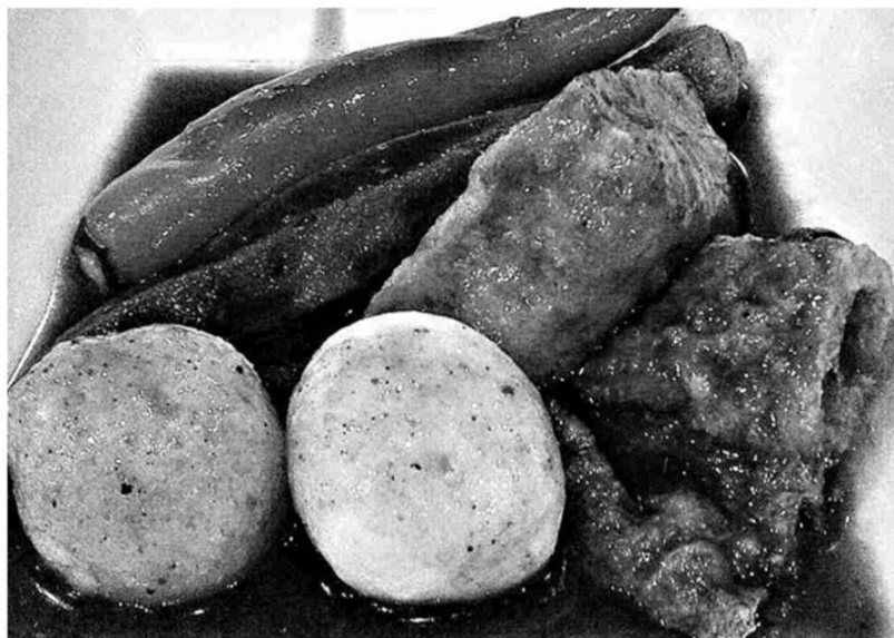
One of the local favourites, Yong Tau Hu

AYER KEROH - The month of Ramadan is all about giving and sharing, apart from showing kindness, generosity and striving towards achieving higher spiritual reality.