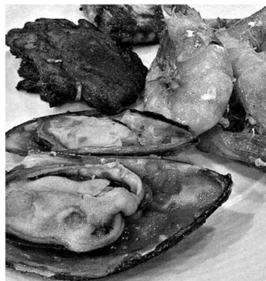
Sumptuous Ramadan spread by Philea Resort and Spa

For reservations and enquiries please call 06-289 3399 or email resv@phileahotel.com.my