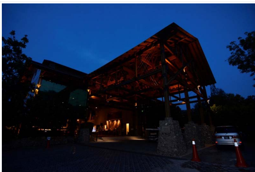
Philea Resort before Earth Hour 2015

In support of the global call for action on climate change, Philea Resort and Spa, Melaka took several momentous measures, including turning off lobby lighting, dimming or turning off non-essential lighting such as restaurants and swimming pools for one whole hour – from 8.30pm to 9.30pm. The room guests were informed at the time of check-in about the resort's observation of Earth Hour on the morning of 28 March 2015 to encourage them to switch off non-essential lights and unplugging non-essential equipment for an hour. A sign was positioned at reception and restaurants as well in reminding guests about the Earth Hour event.