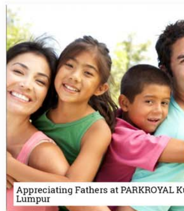
Appreciating Fathers at PARKROYAL Kuala Lumpur