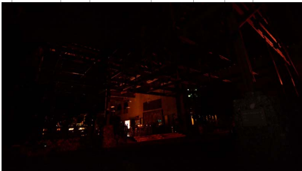
Philea Resort during Earth Hour 2015